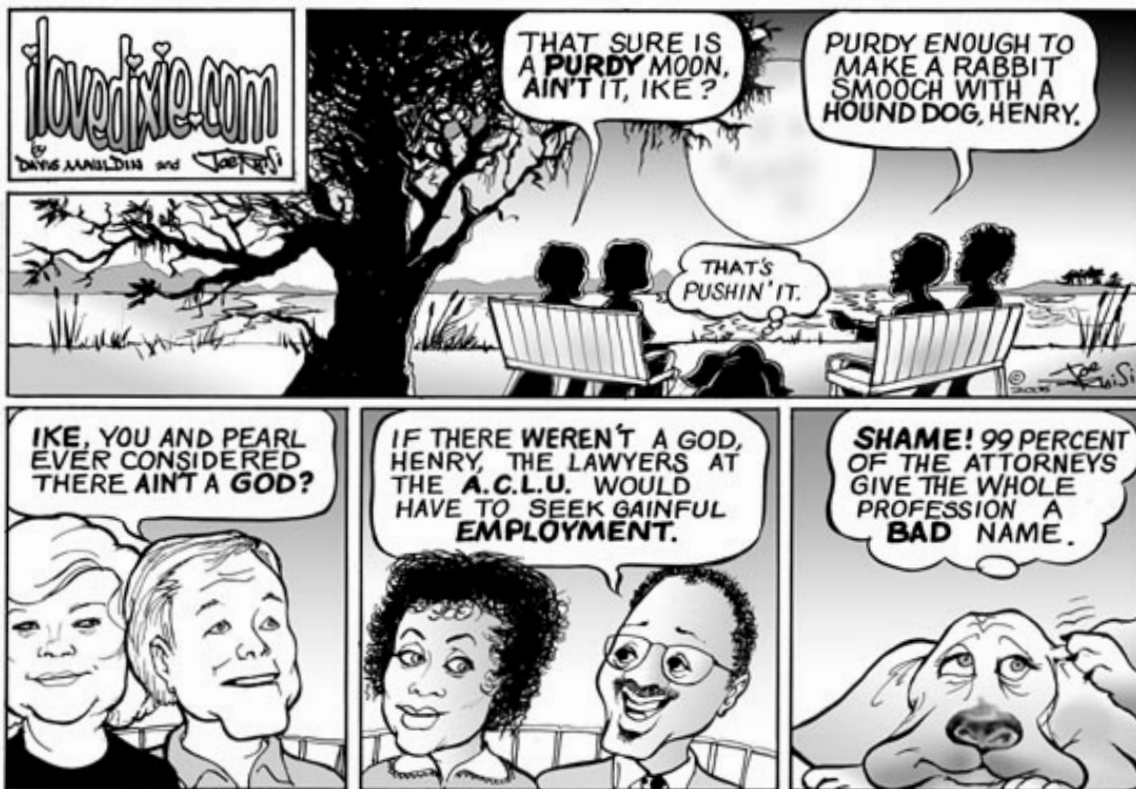
For your very own free copy of "ilovedixie.com" every week, visit www.ilovedixie.com .