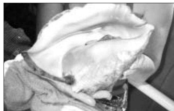
inside. (See the photo.)

One quickly loses all sense of time on snorkeling voyages, with the never-ending panorama always