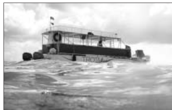
level 50 or more yards away. Below right: This is a seashell our guide dove down and brought up. The conch was still alive inside it.

to 200 feet visibility, depending on the weather and season.