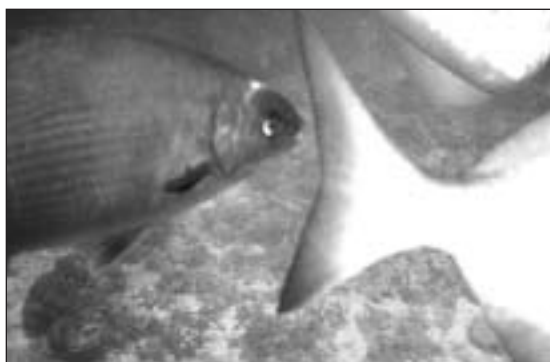
SNORKELING—Above left: Something seems fishy about these fellows. Above right: This is the skiff that took us to Palancar Reef. I took this at water

The underwater life is abundant and the clarity of the water means 100